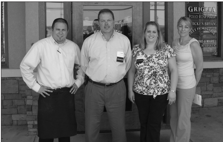
KinderCare and Carrabba's Italian Grill partnered to sponsor an Afternoon Networking Mixer on June 15.