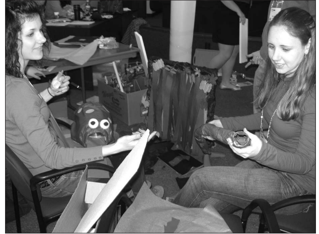
Students in the Junior Leadership program created golf hazards for the Cleve J. Fredrickson Library Birdies for Books event as part of their January curriculum on Community Service.