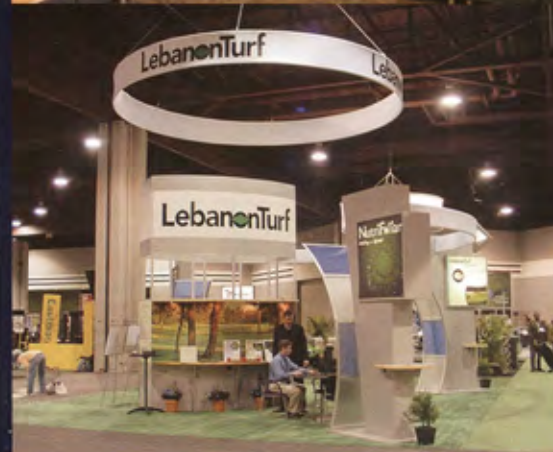
TRADE SHOW GRAPHICS