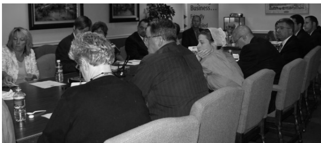
The Chamber Economic Development Committee works on projects to ensure the future economic viability of the west shore.